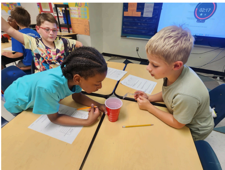
4 th Grade Science