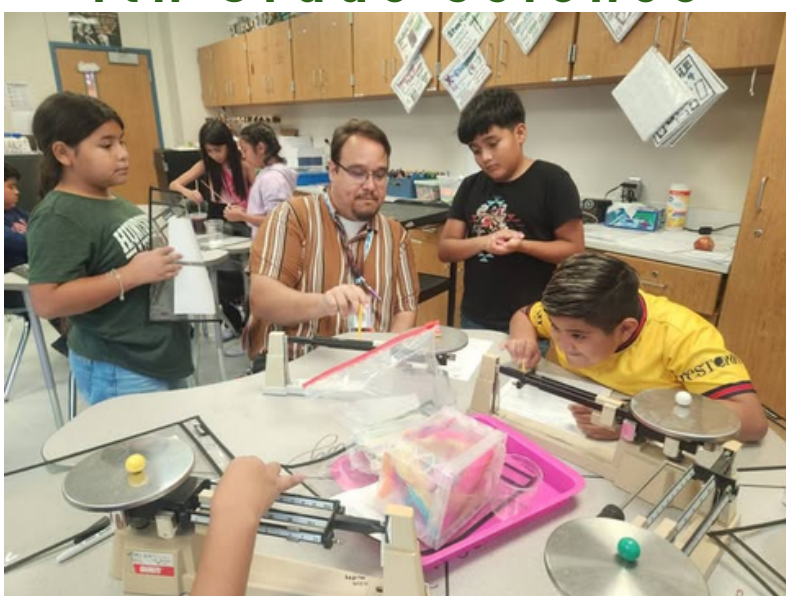
5 th Grade Science