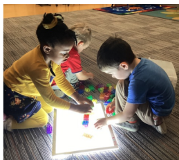
Tanalian- Exploring Light