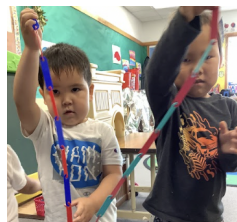
Newhalen- Making Patterns