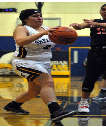
They will be playing Culver Saturday February 15<sup>th</sup> at 2pm, here in the Spartan Dome.