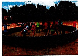
Gaga Pit $1,600

150 pieces of equipment including tether balls, kickballs/soccer balls, table top pump, softballs, cones, jump ropes, bean backs, and more