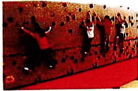
Climbing wall for Gym $5,900