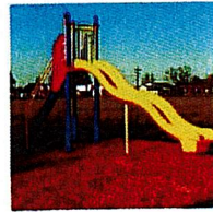
Slide $7,100 (Plus Shipping)