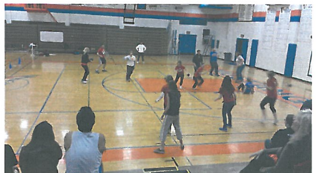
FBLA Girls vs Teachers