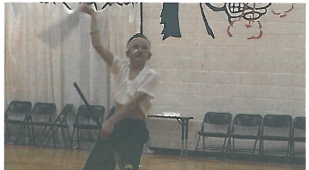
Miles Davis playing Quidditch