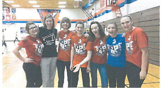
FBLA Girls Team