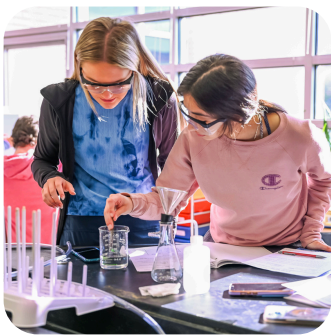
Average Daily Attendance (ADA)

Attendance directly impacts students' academic success and personal development. Regular attendance helps students keep up with the curriculum, build consistent study habits, and maintain steady progress in their learning. It also promotes social interaction and the development of interpersonal skills, fosters a sense of responsibility and discipline, and enhances engagement with the school community. Missing school can lead to gaps in knowledge, lower grades, and a decreased sense of connection to the school environment, which can affect long-term educational outcomes.