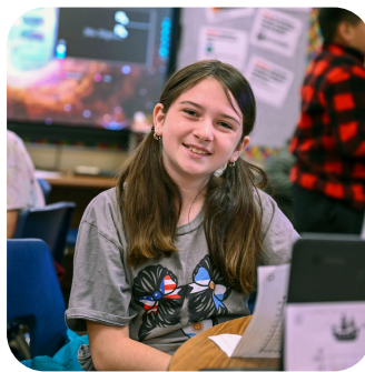
Average Daily Membership (ADM)