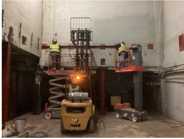
Structural Steel Erection