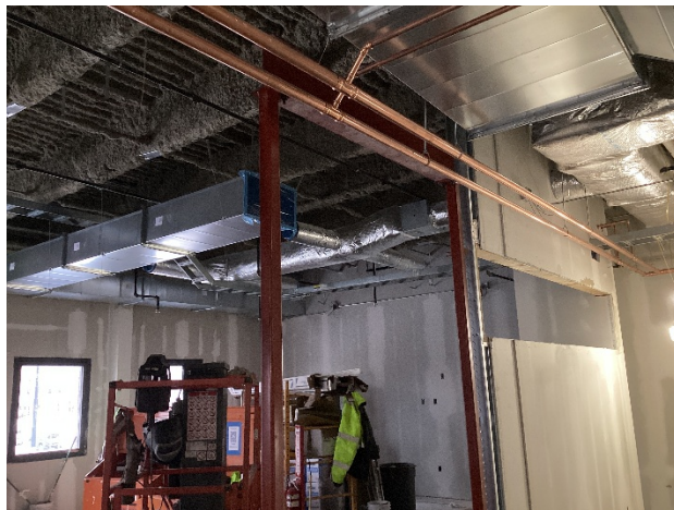
Mechanical Heating Lines