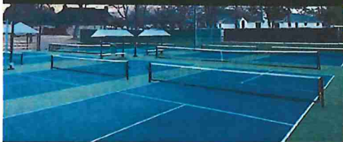
HOLLY TREE COUNTRY CLUB, TYLER TEXAS