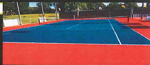
UNIVERSITY OF TEXAS AT TYLER

WE OFFER FULL TURN-KEY POST-TENSION COURT CONSTRUCTION, POST-TENSION CAPS, RESURFACING, REPAIR AND MORE.