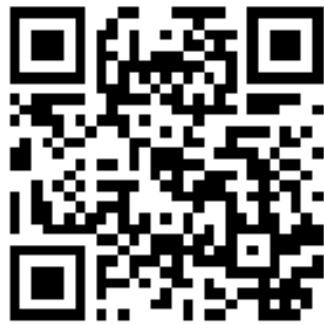
Denton County Elections