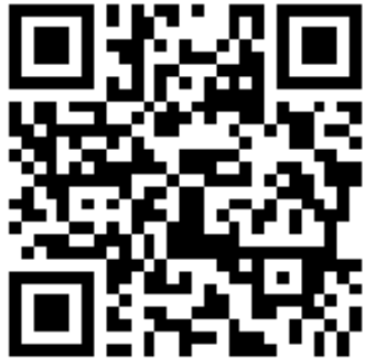
Texas Secretary of State