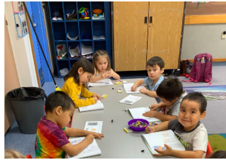
Little Hands @ Work Newhalen