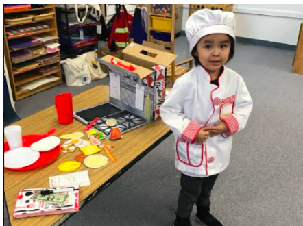
Cheffing up Treats Nondalton