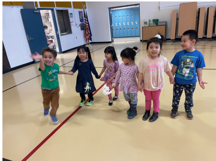
All Smiles Kokhanok