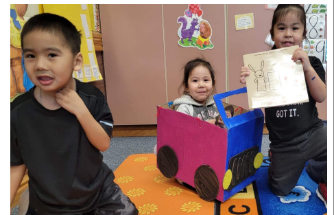
Not Just a Box- Creative Design Perryville