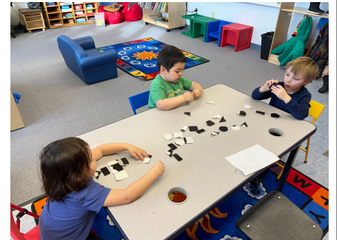
Exploring Fur Shapes Meshik