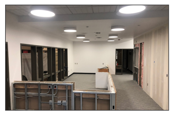
Office reception area