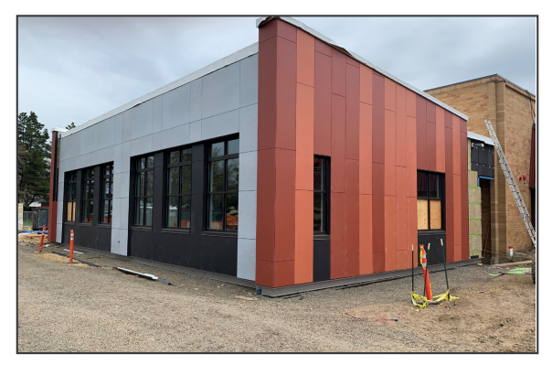
Northeast addition exterior siding