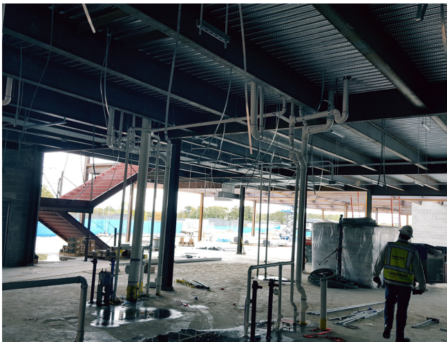
Overhead Utilities in progress