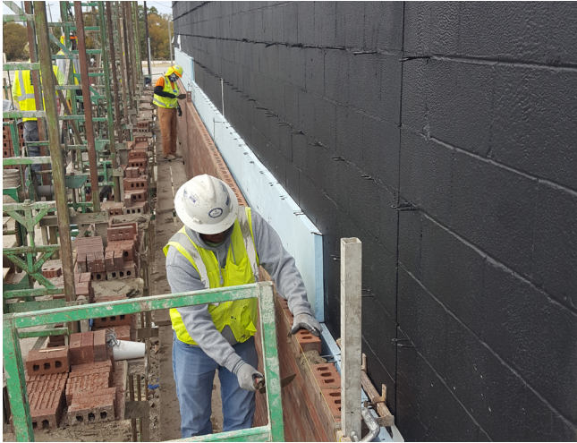
Brick Veneer in progress