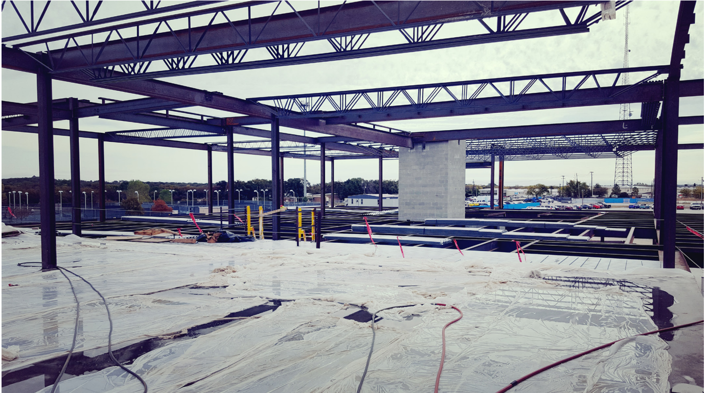
Second Floor Slab in Progress