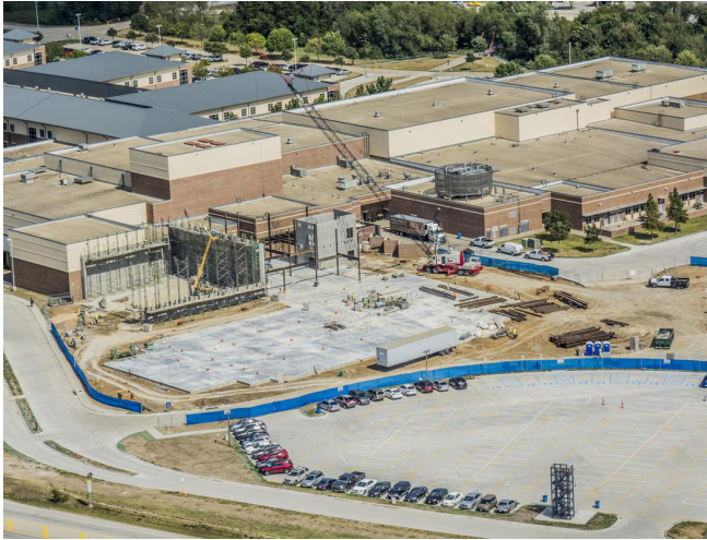
Band Hall CMU in progress