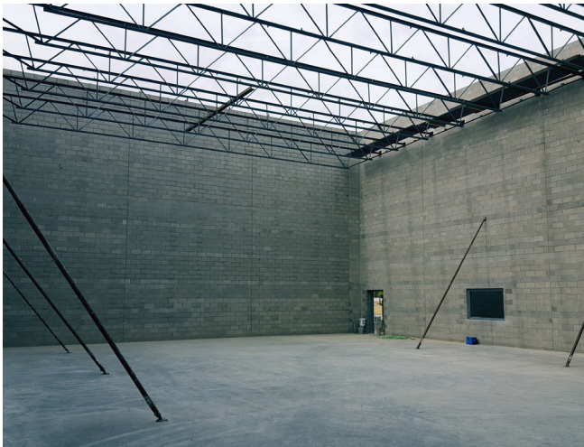
Band Hall CMU and Joist