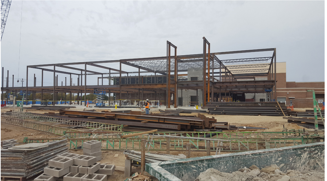
Construction Site Facing North