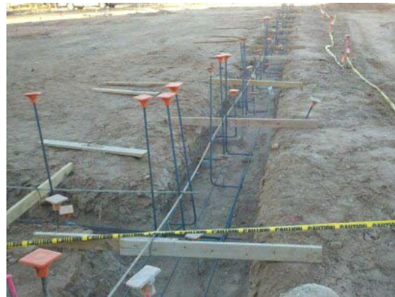
New Classroom Building Footers