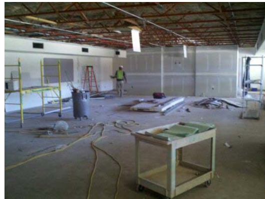
CDO Café Work in Progress