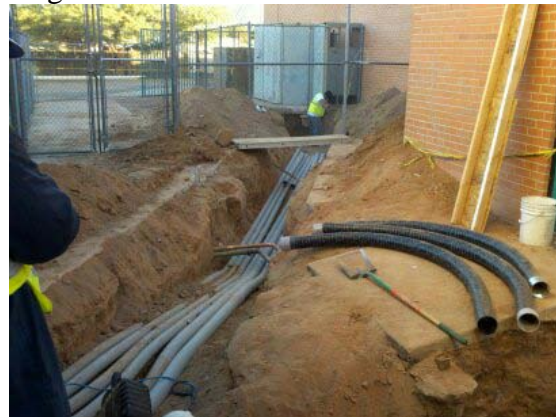
New Underground Electrical and IT Service Pathways