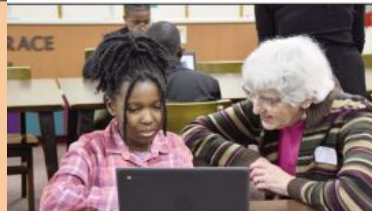
From Front Page

At the awards ceremony, each of the selected students sat with a visitor to demonstrate their handiwork. Each