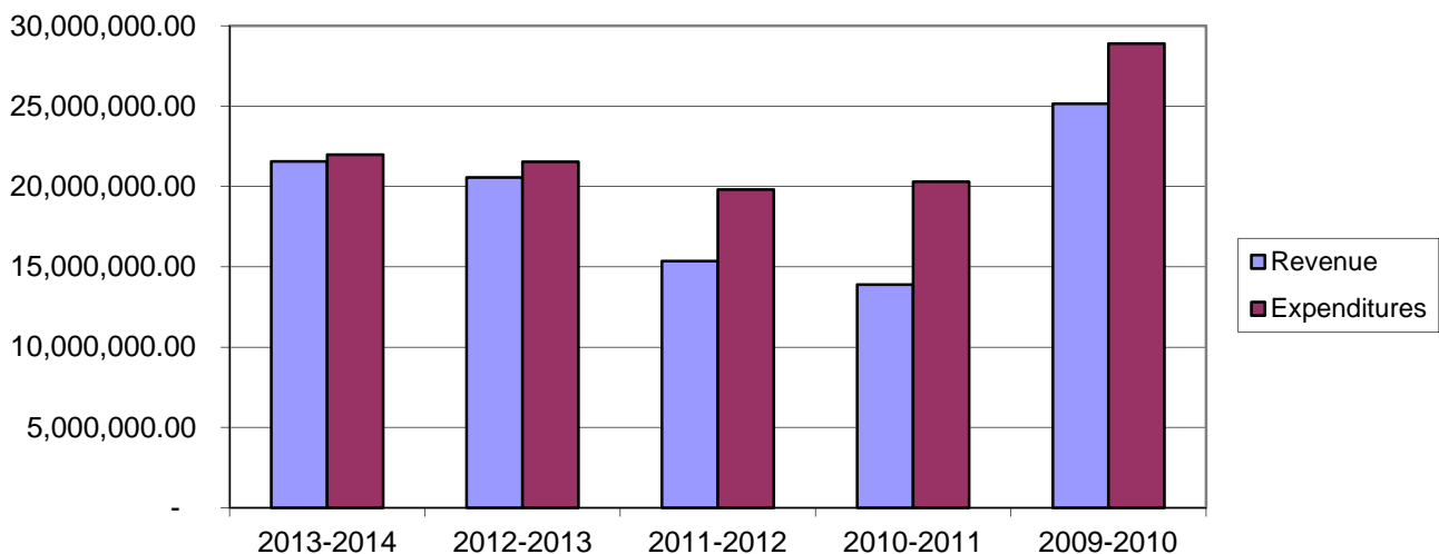
General Fund YTD Revenues & Expenditures