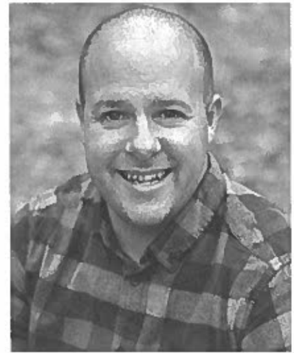
( https://conference.learningforward.org/speakers/a-j-juliani/ )

Cultivating a joyous and just education for all