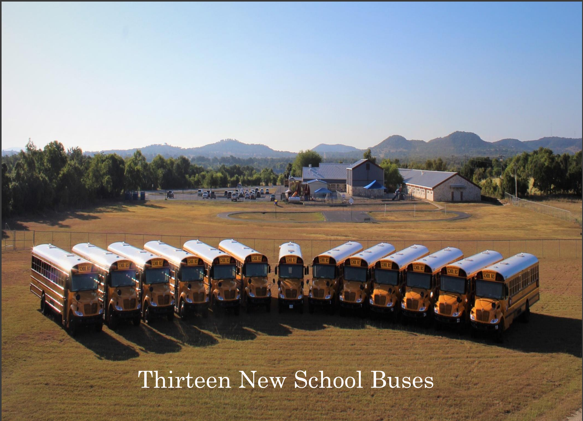
Thirteen New School Buses