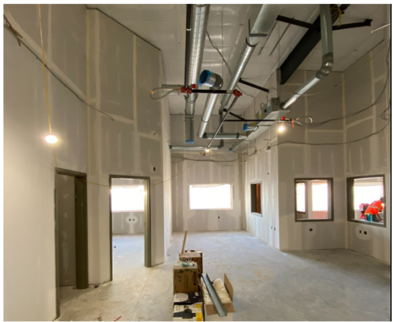
Getting prepped for paint