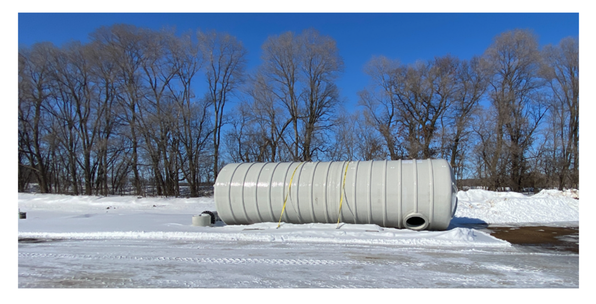
Before and after tank burial. We are getting some snow melt!