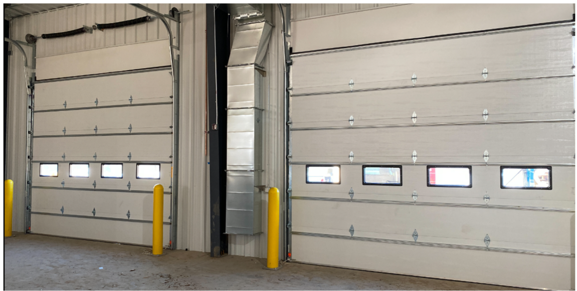
Area B overhead doors installed