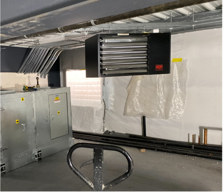
Air handling unit in place on mezzanine