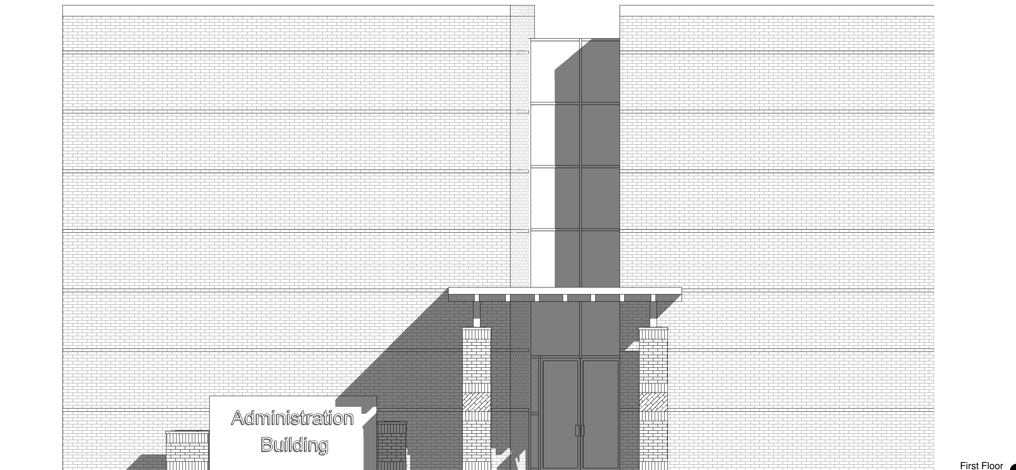
② Canopy Option 1 Elevation 1/4" = 1'-0"