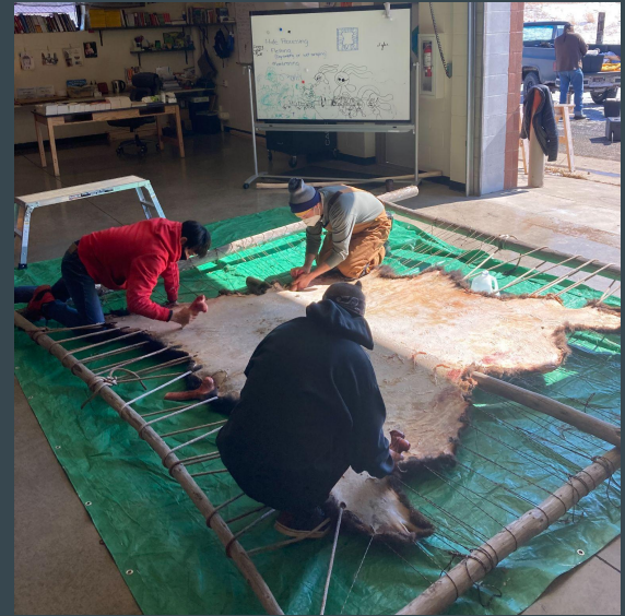
Collaboration w/FAST Blackfeet