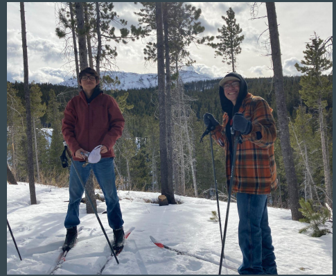
XCountry Skiing at Maria's