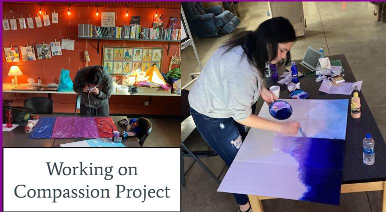
Working on Compassion Project