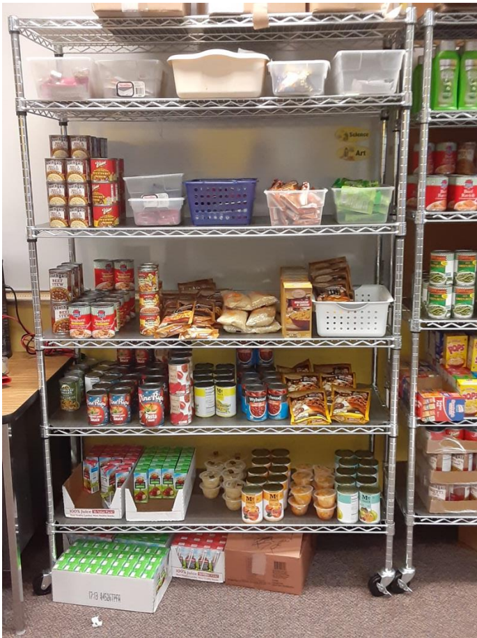
Babb Elementary School Food Pantry (pictured above)