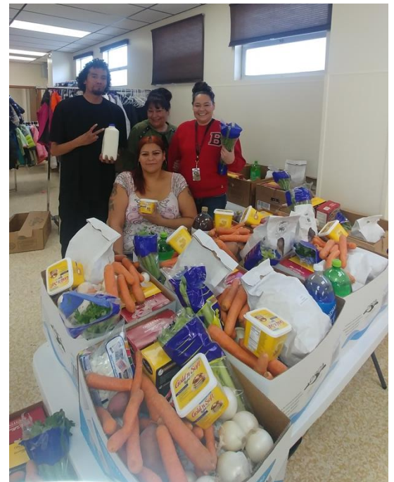
Volunteers putting together the Thanksgiving feasts

We want to give a shout out to Samantha Devereaux for re-establishing the Babb Food Pantry!