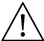
Risk Retention Groups