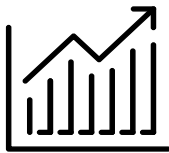
Surplus Lines Insurers