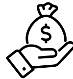
Risk Purchase Groups