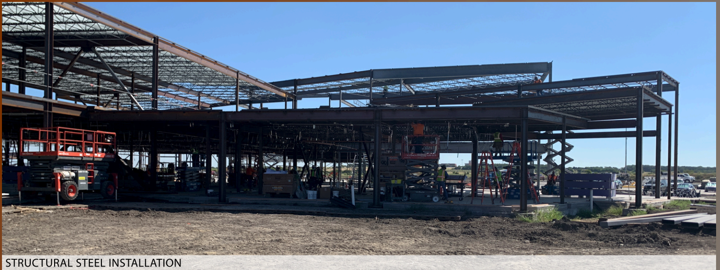
STRUCTURAL STEEL INSTALLATION