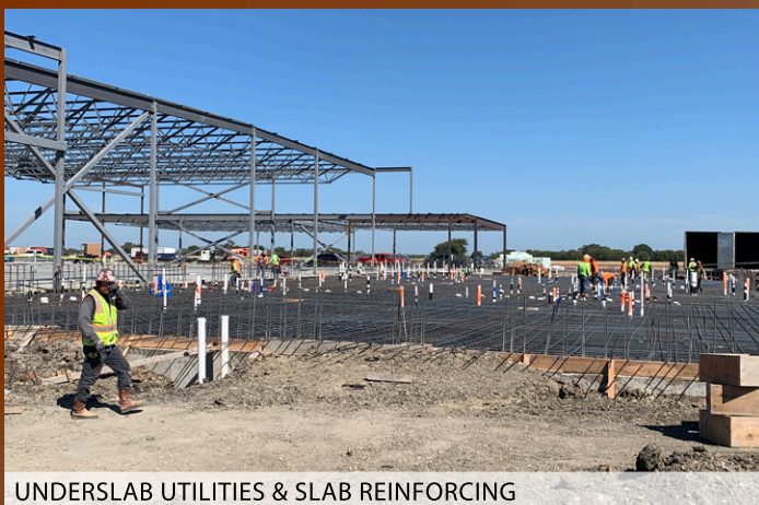
UNDERSLAB UTILITIES & SLAB REINFORCING