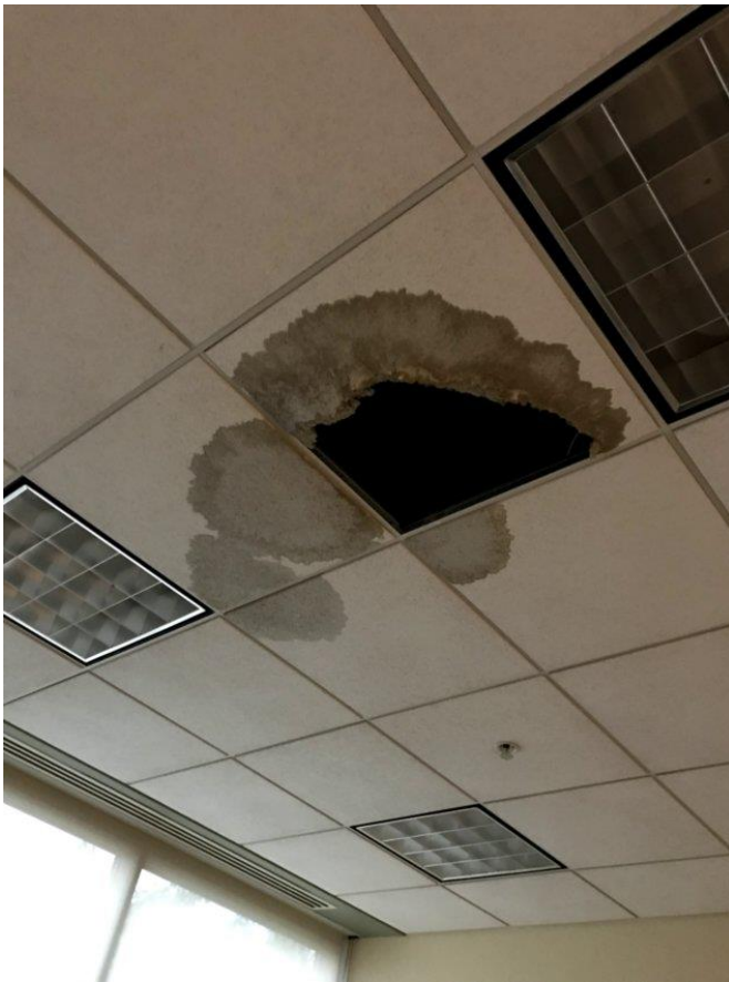
Flex Room, September 9

Our area sustained heavy rainfall the weekend of Saturday, September 8 and Sunday, September 9. The library resultantly had two interior water leaks of some significance. The first area to begin leaking was the Flex Room on that Saturday afternoon. Before closing on Saturday, the Technology Room also had an area begin to leak. Several computers had to be temporarily removed. AAA Roofing was able to quickly get to the library and patch the leaks on Sunday. Although we experienced leaks from two locations, a total of six compromised areas were patched on the roof. While the leaks were being repaired, AAA began working on an estimate for a new roof for the library. I anticipate having that estimate in hand the week of our meeting.