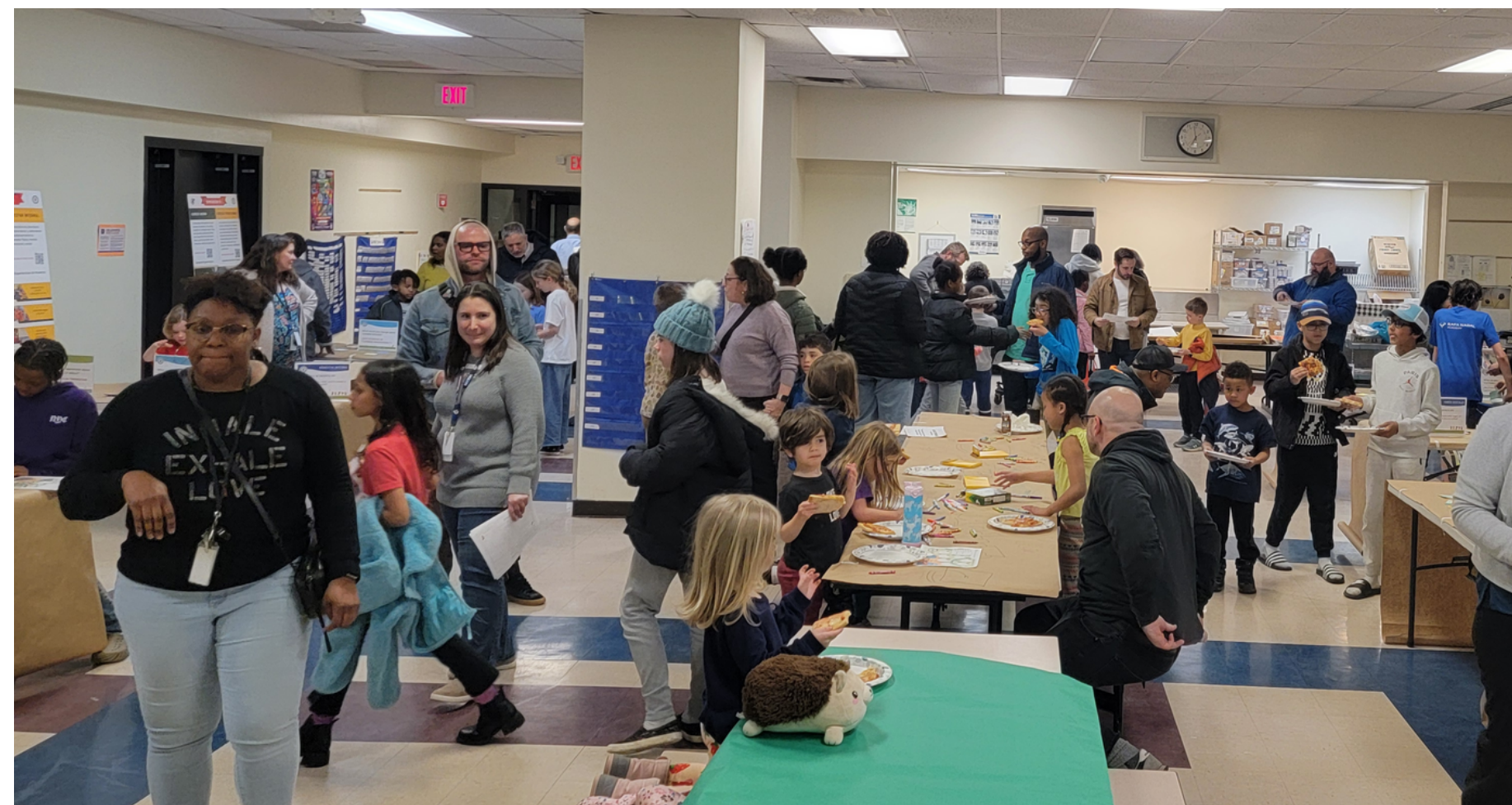
Hatch Elementary School March 6, 2024