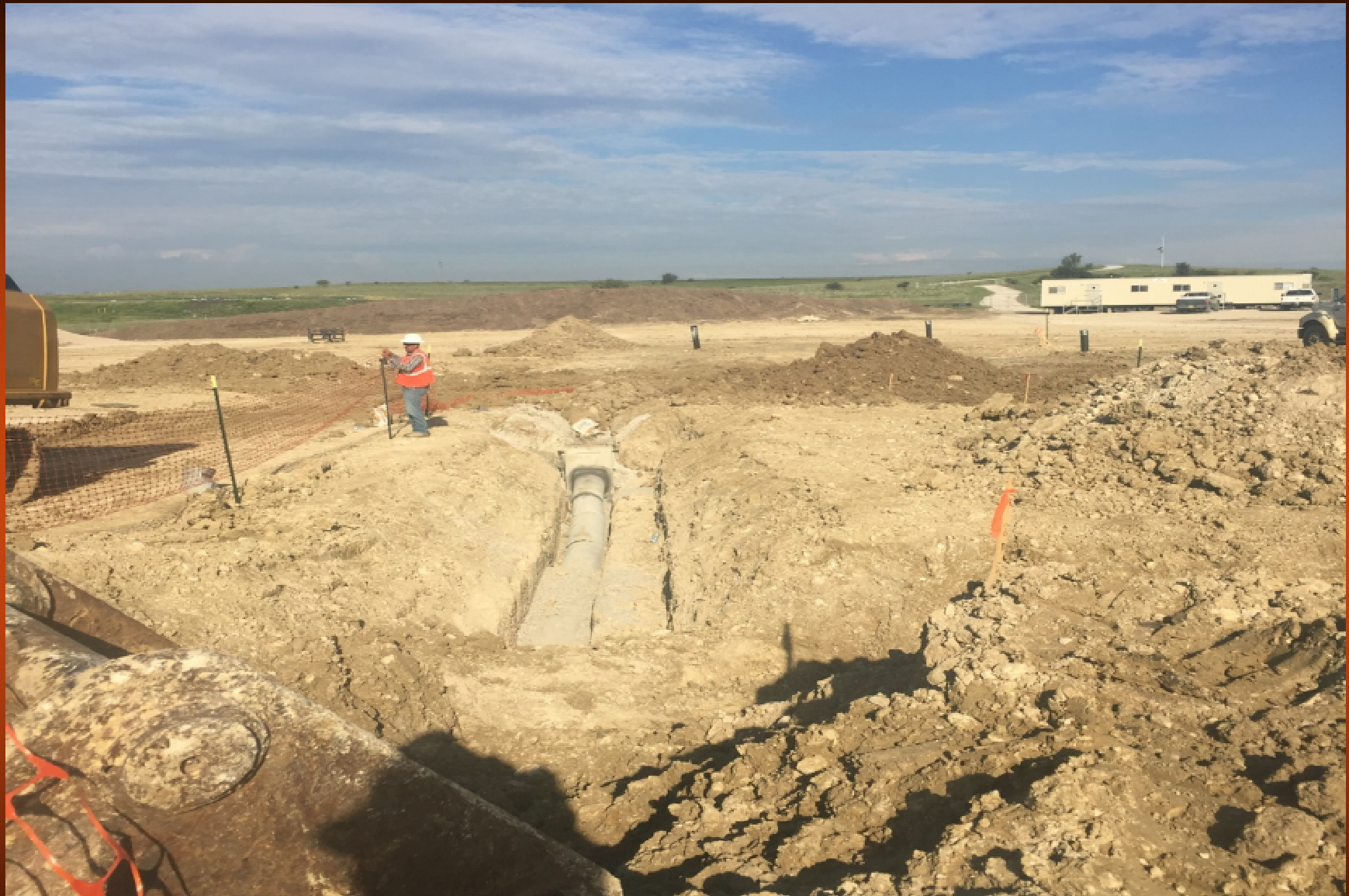
Elementary 5 Crawl Space Storm line