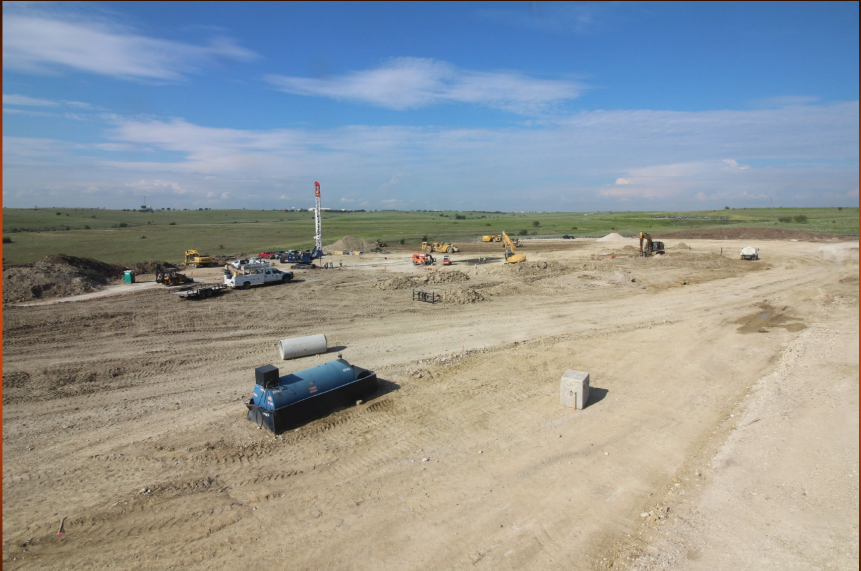
Elementary 5 Site Overview