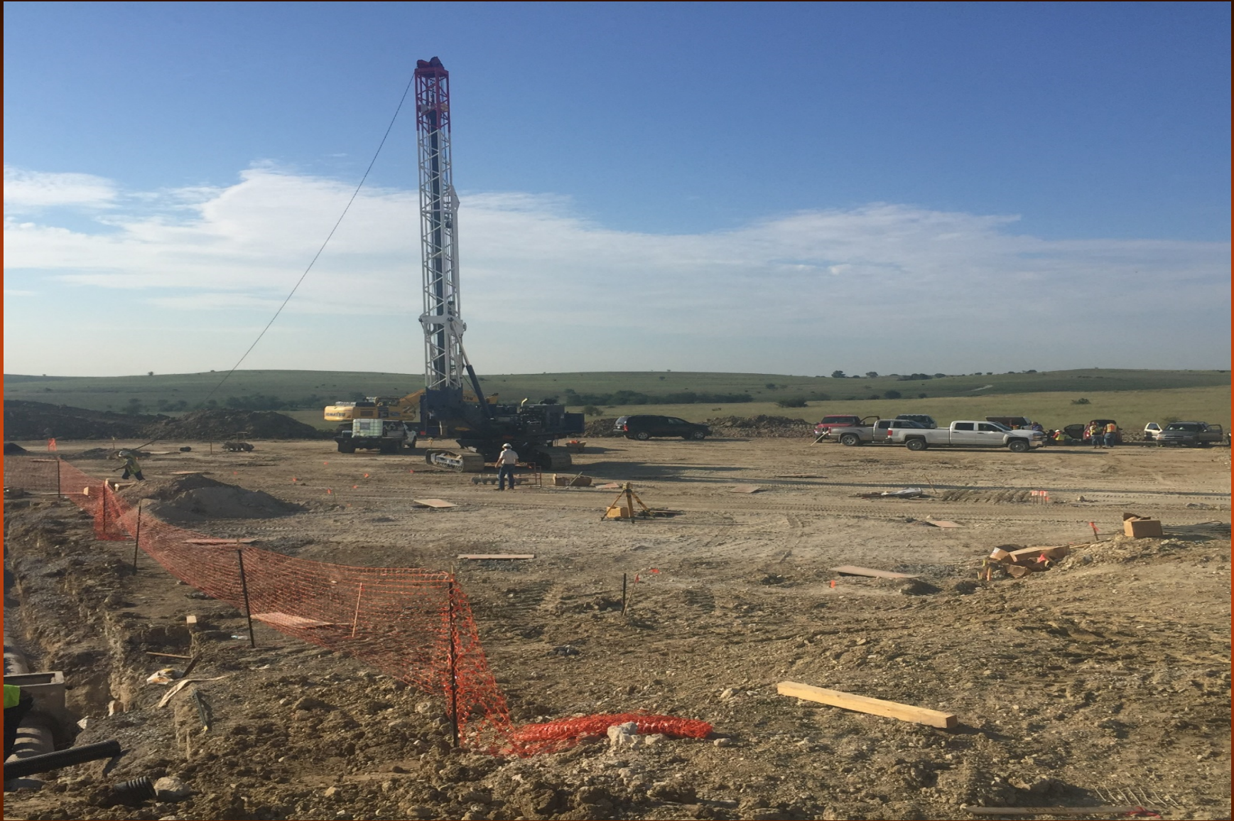
Elementary 5 Pier Drilling at South Pad