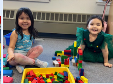
Teamwork = Smiles