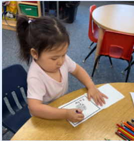
Early Writing & Vertical Painting