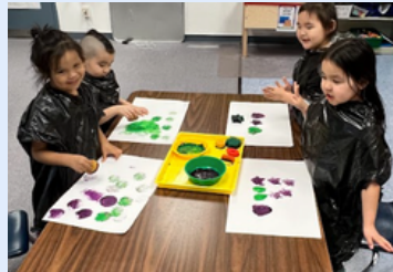
Sharing & Creating