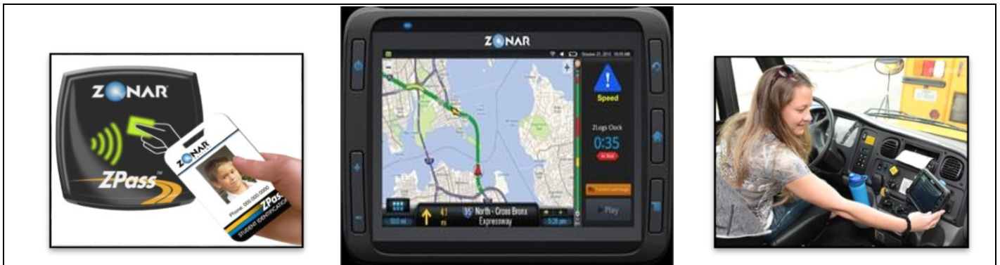
Pass Card Reader Student Bus Access Card