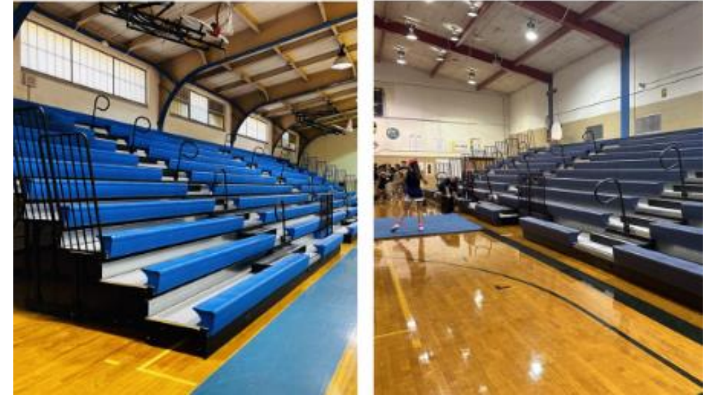
New Middle School Bleachers