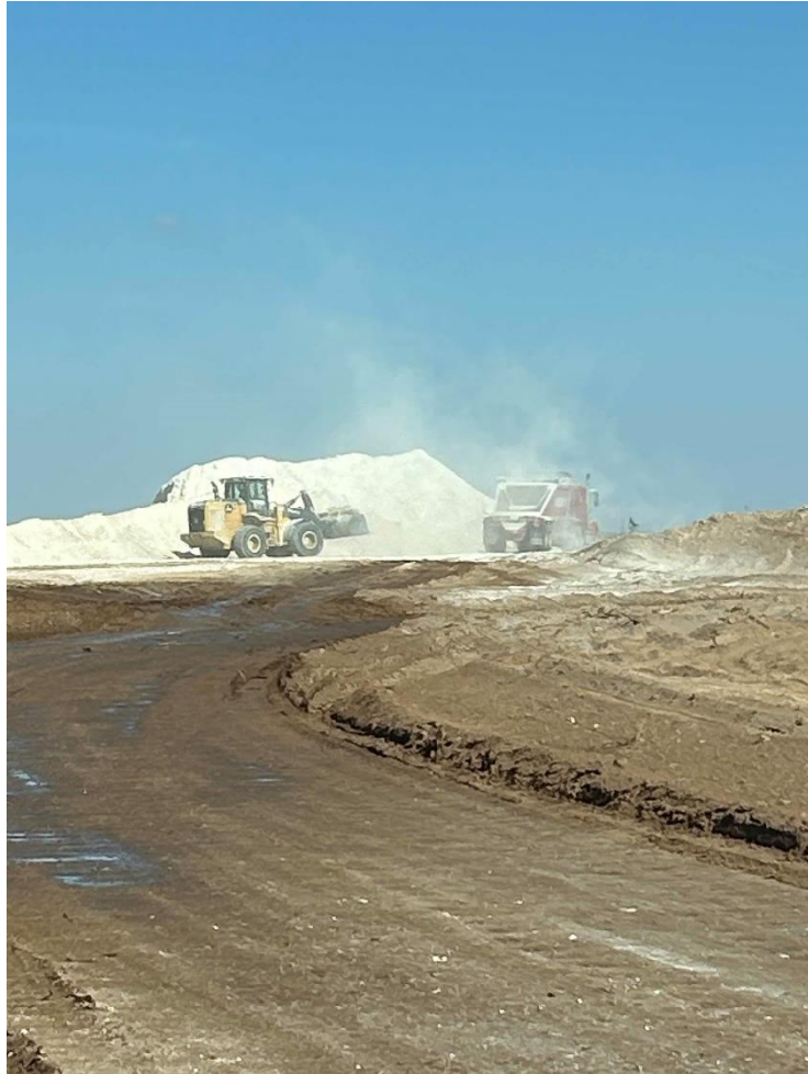
New Middle School Site