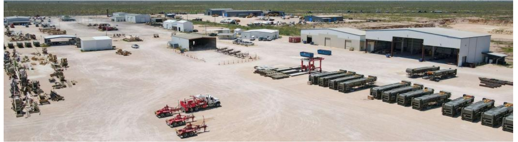
Proposed Transportation Location