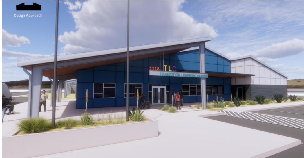
New Transition Learning Center