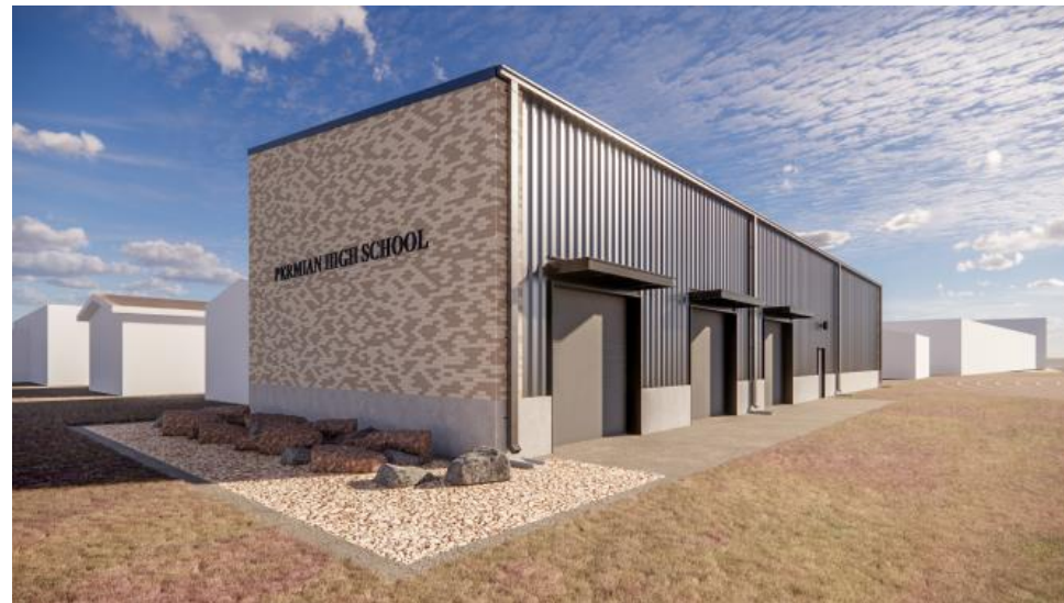
New JROTC Facility