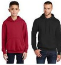
Pullover Hoodie Red or Black $25