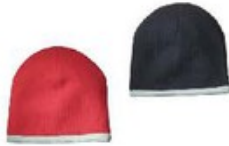
Beanie Red or Black $15