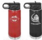
20 oz Water Bottle Red or Black $25