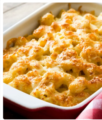
Mac N Cheese