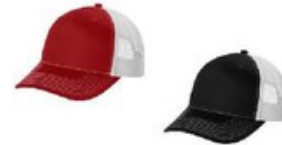
Trucker Hat Red or Black $20