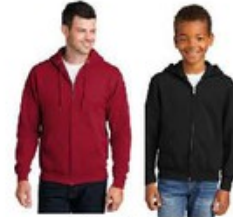
Full-Zip Hoodie Red or Black $30