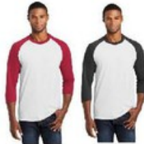
3/4 Sleeve Raglan Red or Black $20