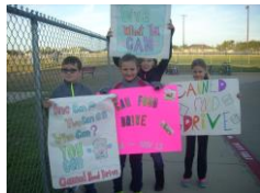
Canned Food Drive

“Honor Bars” were sent in the mail to honor “Star Students” at Brockett. Sixty-three students were recognized and received a chocolate bar in the mail. These students exhibited a great attitude, a hard work ethic, and were students with good manners who contributed to the character traits for the first three months of school.