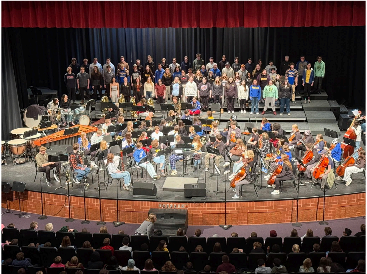
(the demo concert!)