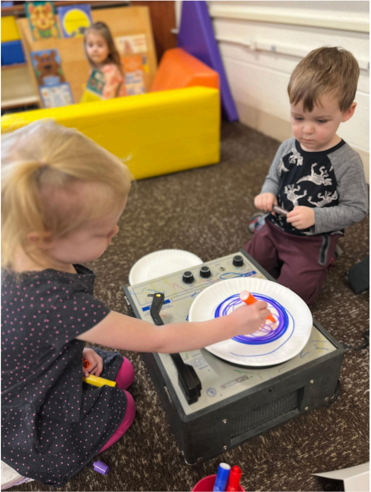
(record player coloring- I love this!)