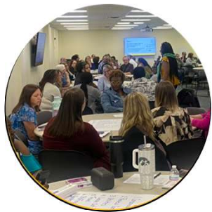
Principal Advisory Committee

Extensive and detailed conversations across the district influenced the development of priorities