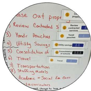
Budget Advisory Committee Meetings