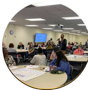
Extended Leadership Team