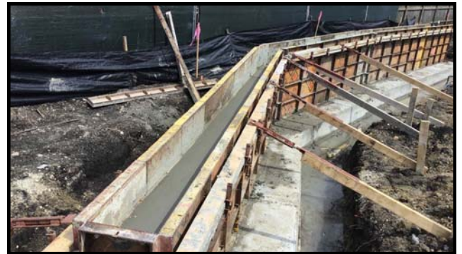
Ames Elementary School