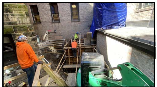
Central Elementary School