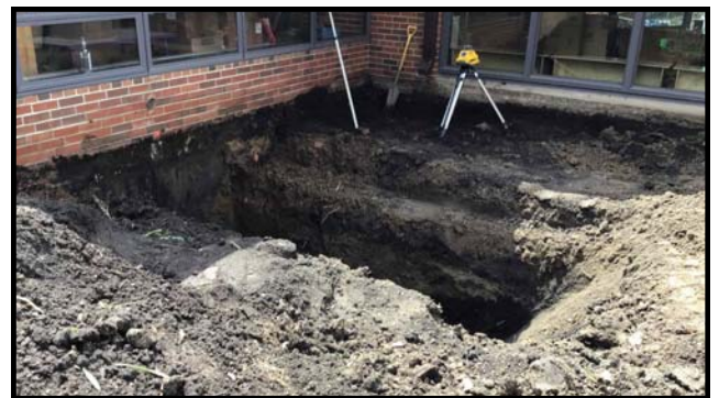
Blythe Park Elementary School