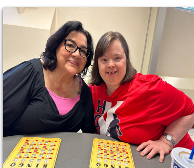
SOAR sold concessions at the 2023 Senior Craft Fair at Lenox and used all the funds to buy new BINGO equipment for Lenox to be used by both Project SOAR and the Senior Programs. SOAR plays BINGO monthly at Lenox. Saint Paul St. Games Field Trip June 2024