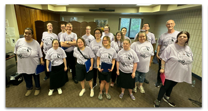
SOAR Songbirds Choir Began in Jan. 2024 to give the opportunity for anyone of all abilities to share their love of music!

Project SOAR provides recreational and leisure programs that are designed and adapted for Adults (18+) with a Special Need/Disability.