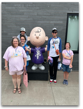
Saint Paul St. Games Field Trip June 2024