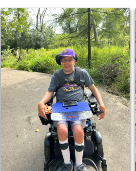
SOAR has a wonderful partnership with Westwood Hills Nature Center. In the past year we have had 9 Nature Classes, 2 Workshops with the W.O.W Mobile Metal Lab Bus, and have done 2 community service projects for Westwood Hills.