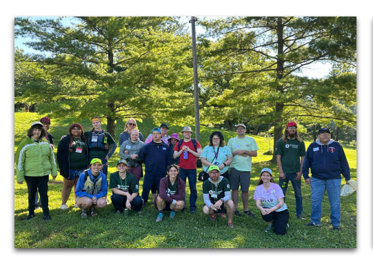
Great Day out with Wilderness Inquiry August 2024 at a local park!