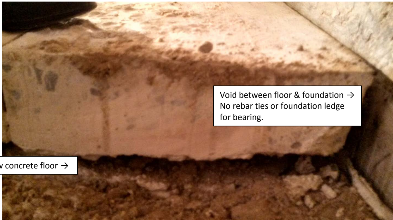
Cross section of the concrete floor (floor was cut and removed to show this view). Picture reveals a 1" void below the floor and between the floor and the foundation.