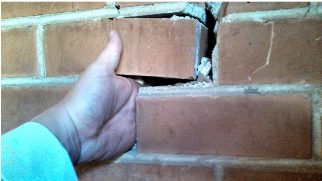
Interior view of the east wall. The brick is not removable by hand. Put hand in crack to show the width of the crack.