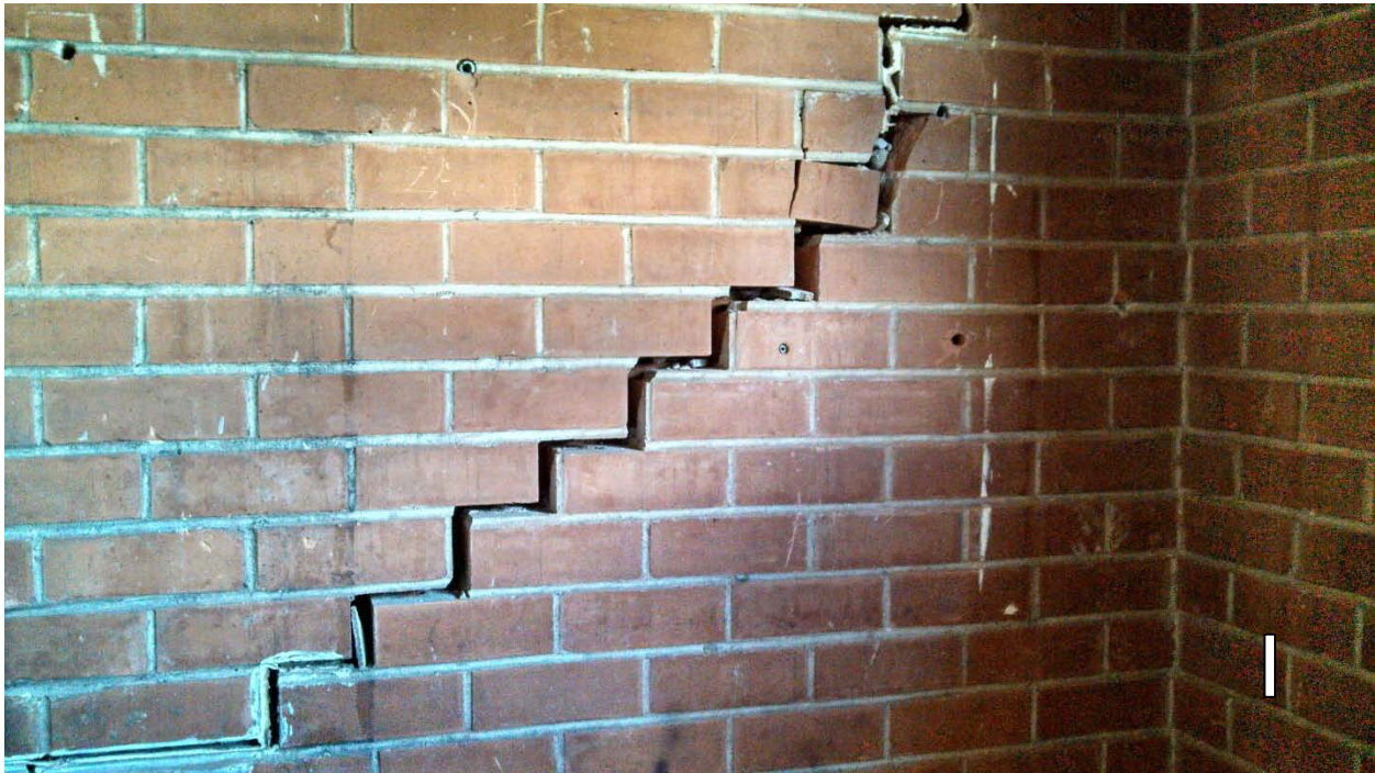
Interior view of the east wall