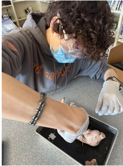
Last week, our students 5+ were able to dissect pigs, grasshoppers, crayfish, fish, and cow eyeballs!