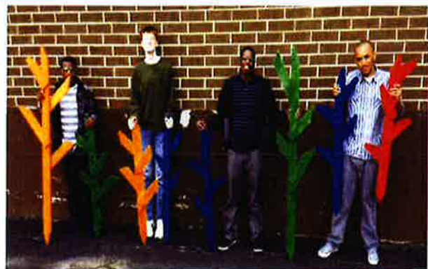
Students pose with garden art they created in Introduction to Basic Construction Skills. The art is available for sale at ALLURE, 410 Ashland, Chicago Heights.