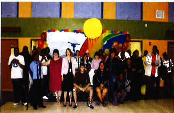
Academy for Lifelong Learning students gather for a group photo at their Spring Gala.