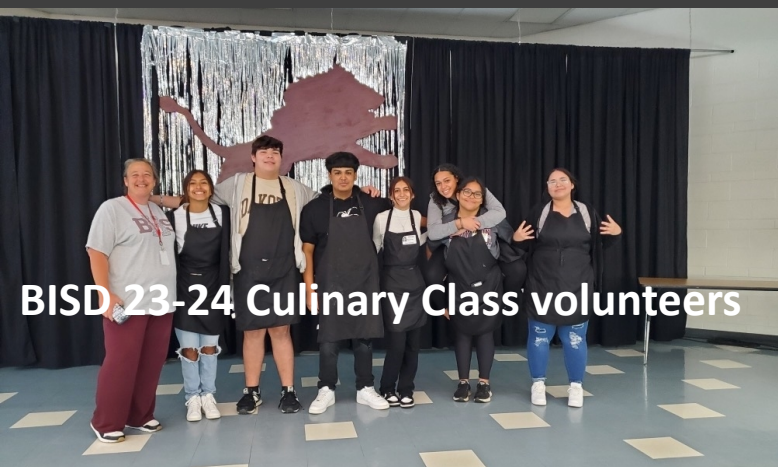
BISD 23-24 Culinary Class volunteers