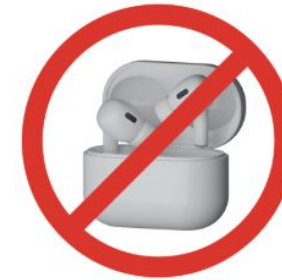
EARBUDS & HEADPHONES