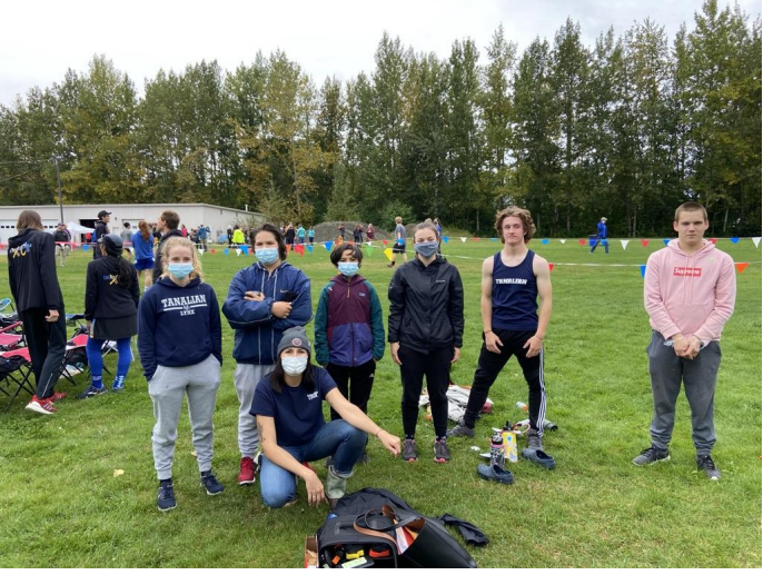
Lynx XC at their first meet of the season in Anchorage!