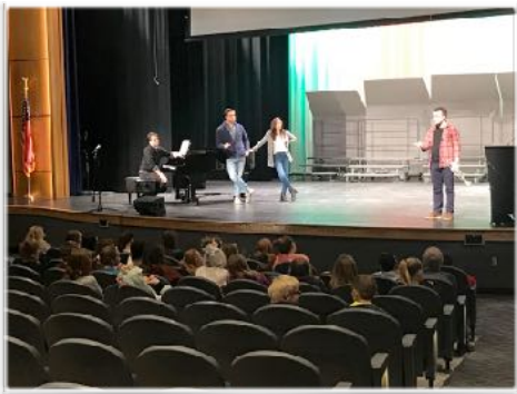
Broadway performers from Elf The Musical did a presentation to all music students, grades 6-12. We were lucky to have both lead actors, the Music Director, and a trumpet player from the Pit Orchestra.