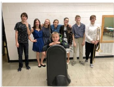
Middle School Honors Band Students at the Shell Lake Arts Center