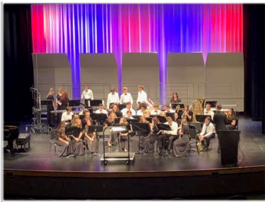
High School Band at the Fall Concert