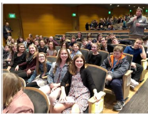
Another picture of 7th Grade Music Students at Orchestra Hall