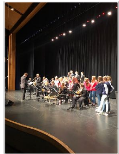
UW-Eau Claire Jazz 2 performed at Unity. High School Jazz students joined them on stage for their last song to get up close to the action.