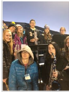
High School Pep Band students at a high school football game.