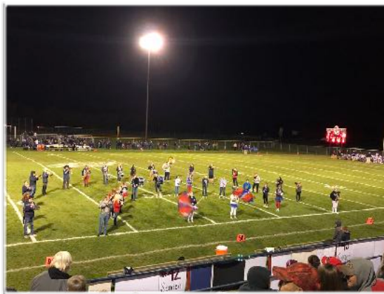
High School Pep Band students at a high school football game.