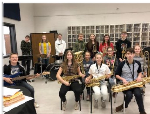
Middle School Jazz Band meets during lunch