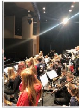
High School Jazz Band students on stage with UW-Eau Claire Jazz 2 ensemble when they came to perform in November.