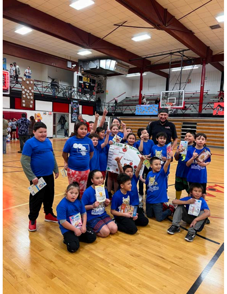
2nd and 3rd Grade March Madness Teams