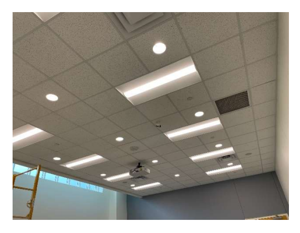
Ceiling Tiles Replaced at Red Room