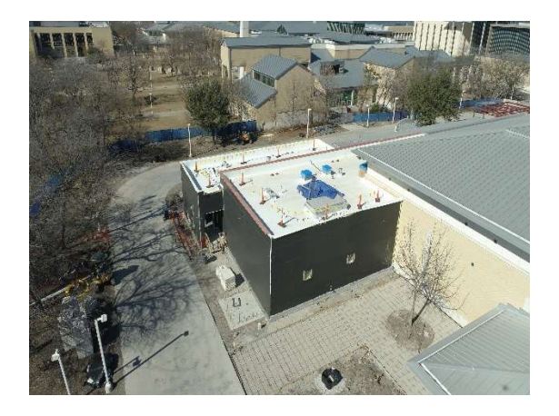
Kitchen Addition at Alumni Hall