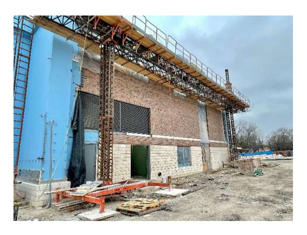
Brick Install on North End of Welcome Center