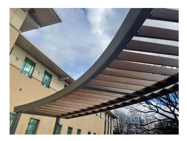
Wood Blades Installed on Trellis at Founders Hall