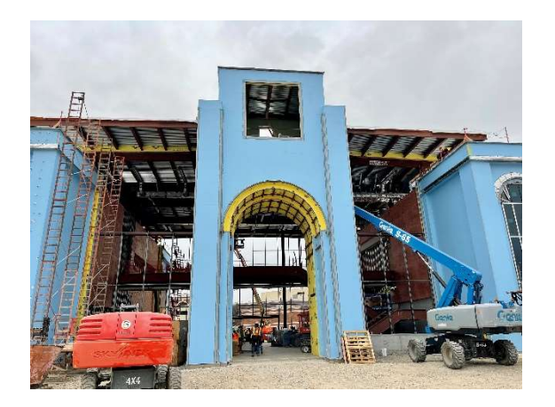
Main Entrance View of Welcome Center