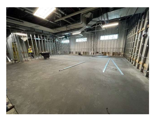
Interior Framing at Dance Studio