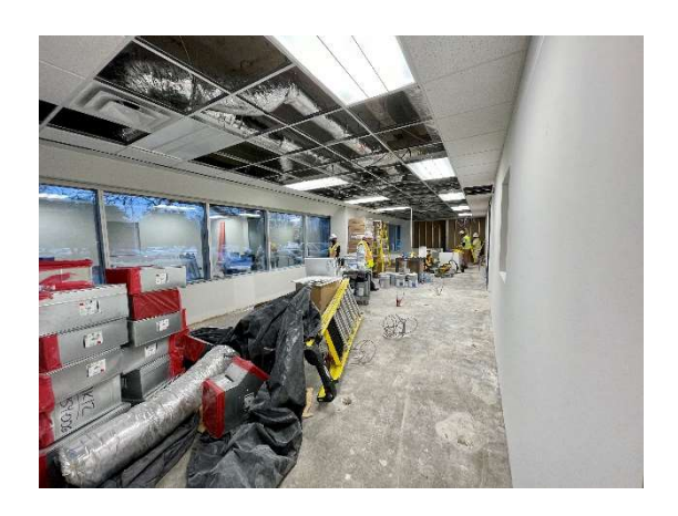
Space for New Dental Hygiene Workstations