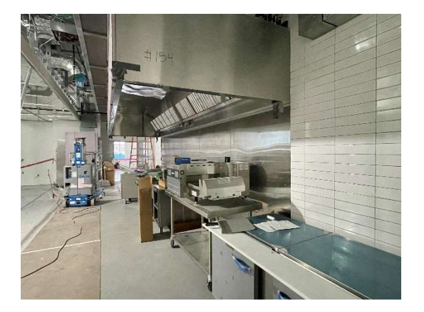
Kitchen Equipment Installed