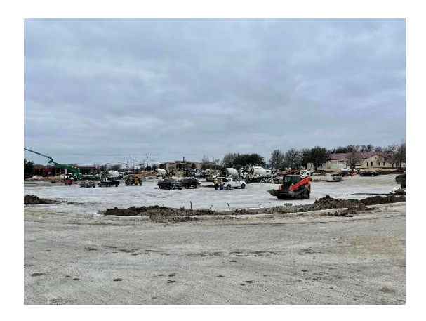
Parking Lot at Southwest End