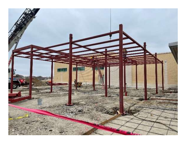
Trellis at Alumni Hall