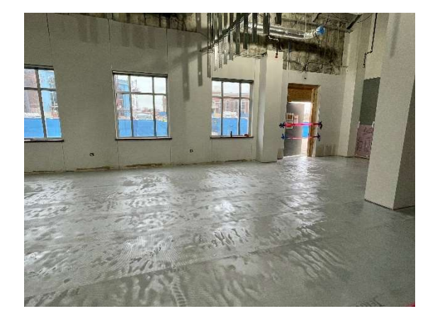
Coffee Shop and Dining Area Room