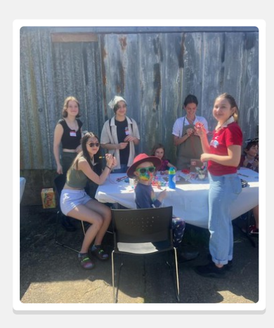
Helping out in the Craft Station

The National Honor Society volunteered in April at the Lower Nehalem Migratory Bird Day Celebration in Nehalem. This event was sponsored by the Lower Nehalem Community Trust. Students helped with the snack and refreshments station, craft station for kids, and the greeting guests at the welcome table. It was a wonderful event with a large turn out and many NHS students attended to help out.