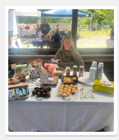
Anyone for snacks?