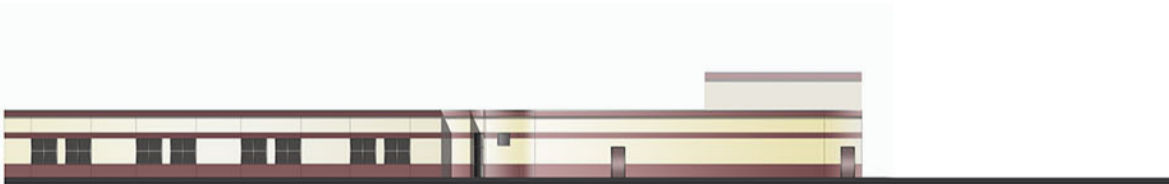
4. CLASSROOM ADDITION NORTH ELEVATION