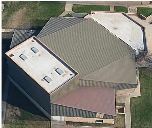
Google Maps image of Auditorium, built in 1984. EE scope includes repair/replacement of all metal roof and wall panels.

EE understands that KISD is requesting design and construction services at Ellison High School for the repair/replacement of the existing metal roof and wall panels at the standalone Auditorium building.