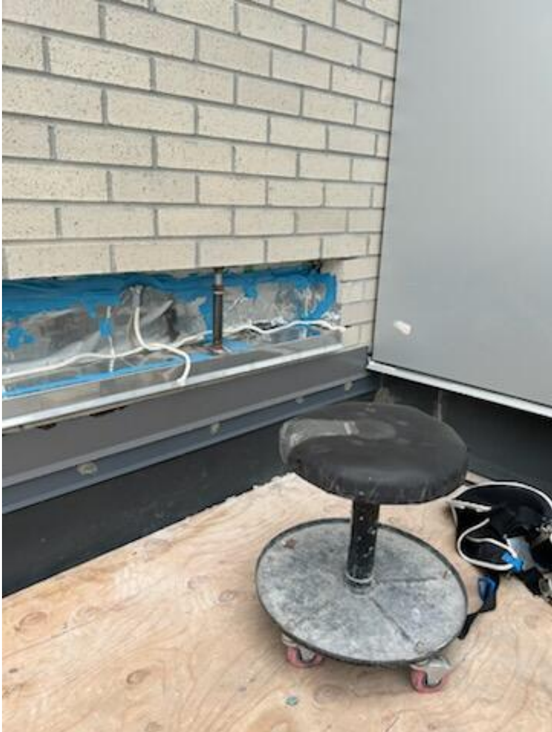
Through Wall Flashing Installation in Progress - New Weeps for Water to Exit the System