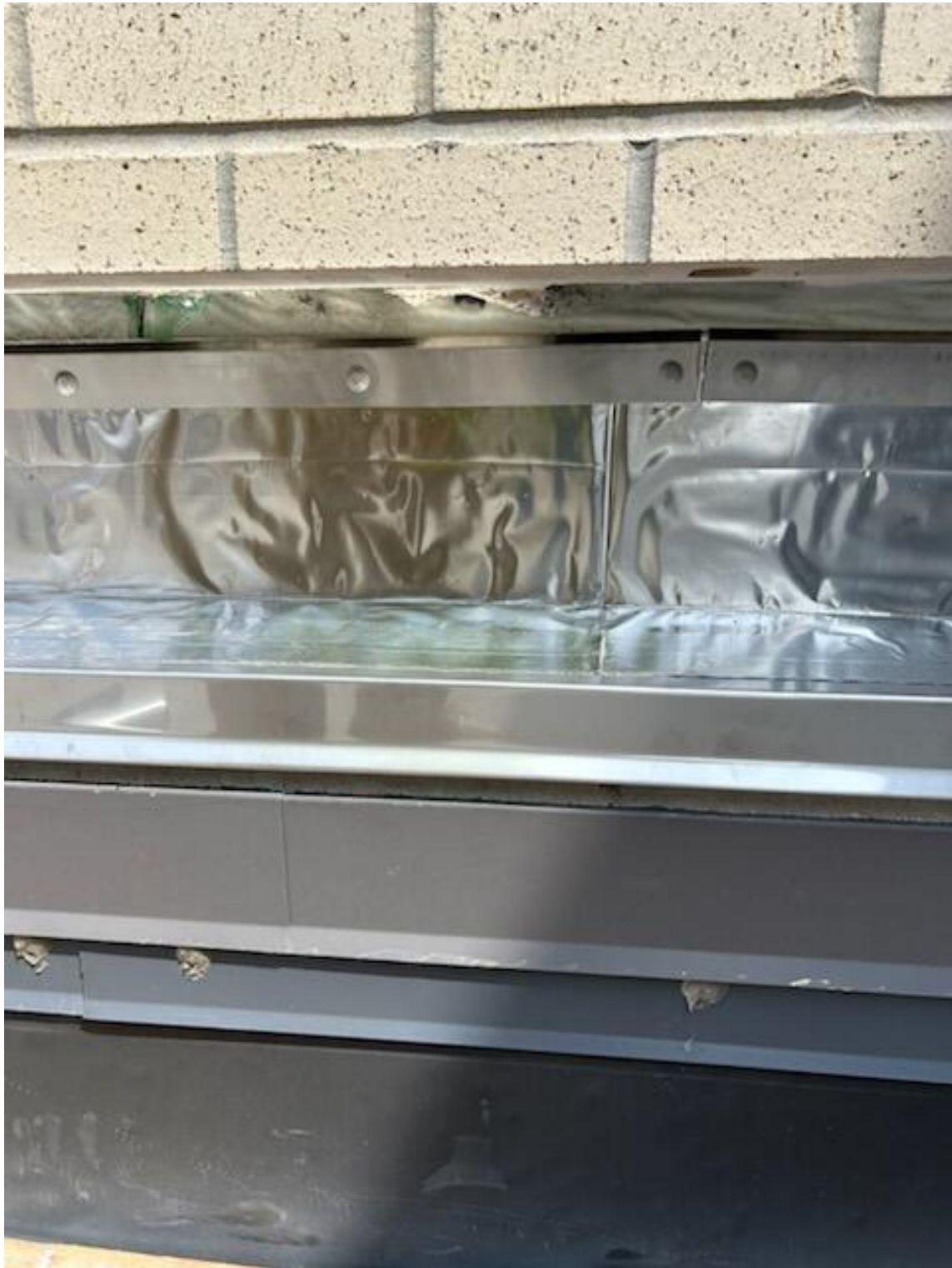
Through Wall Flashing Repair in Progress - 2 Courses of Brick Removed to Install Through Wall Flashing System (Pink Area)