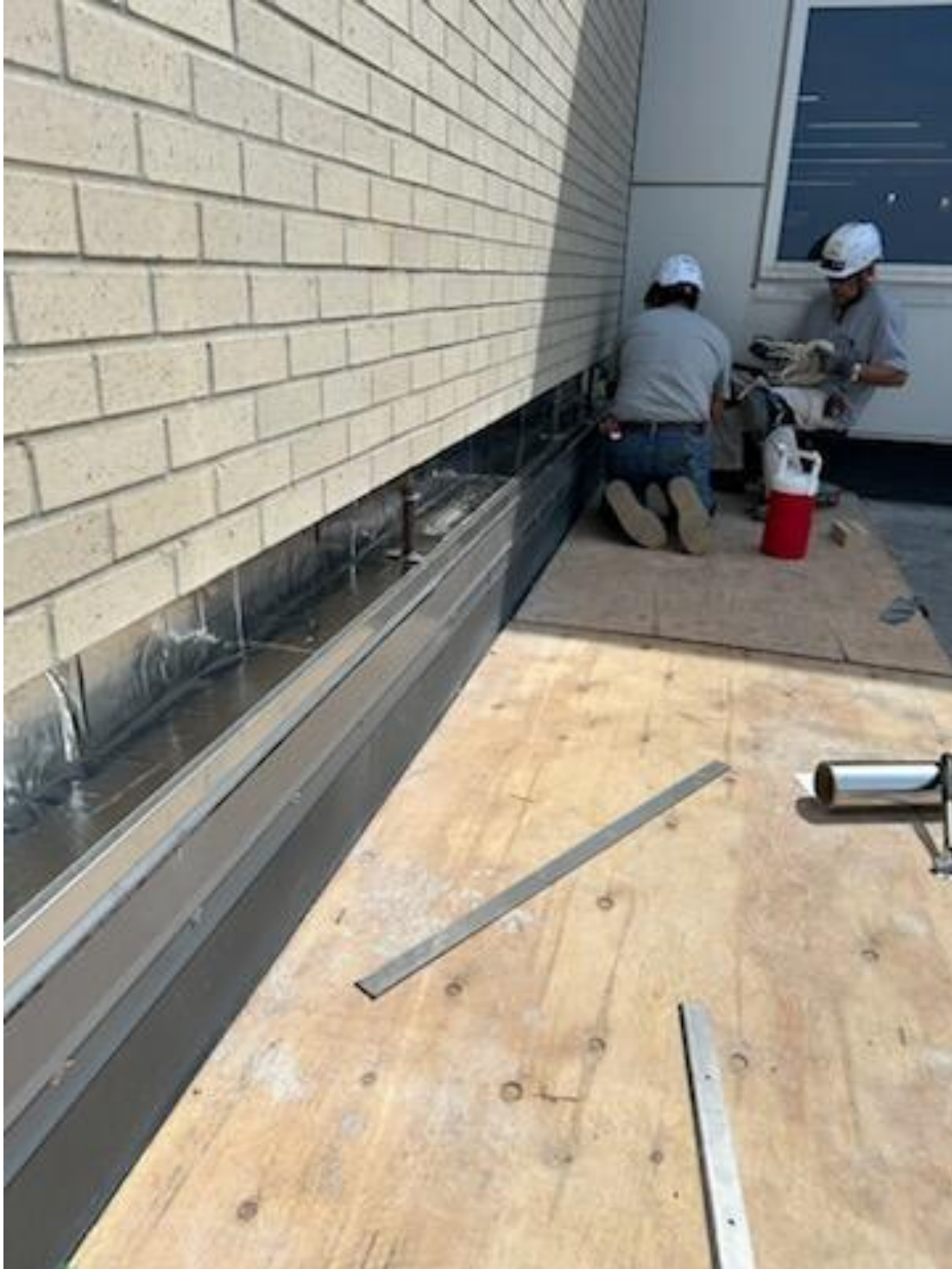
Plywood Protection noted on top of Existing Roofing Membrane