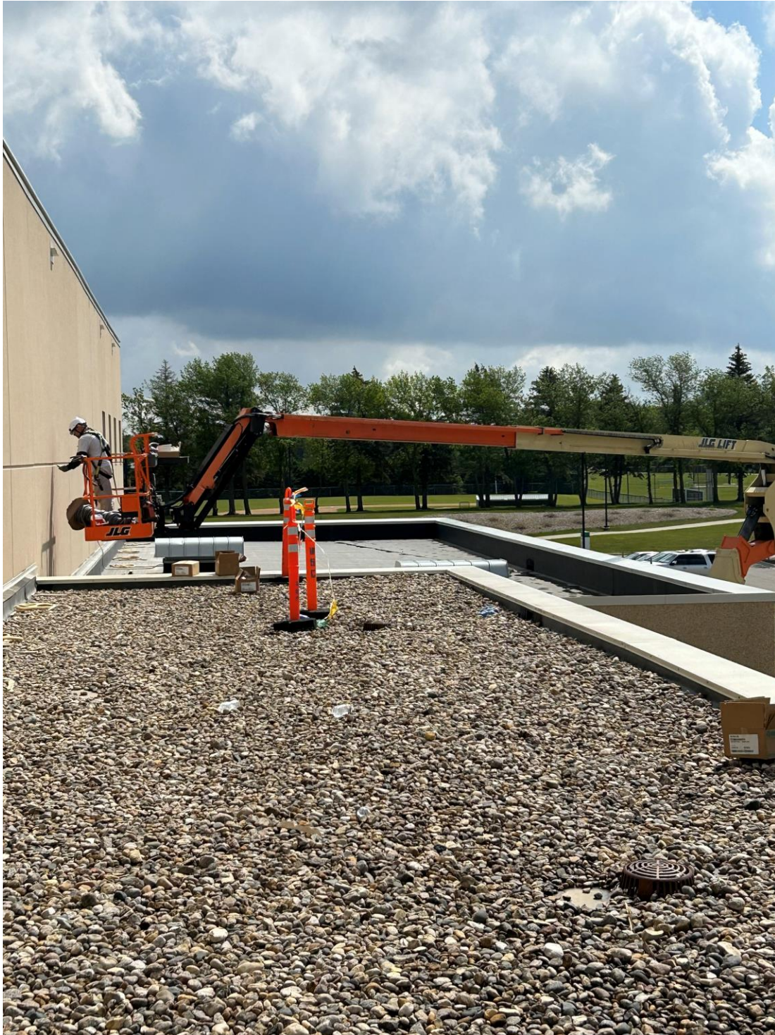
Precast Sealant Replacement in Progress (Orange) Loose residual sealant removed, Replaced with New Urethane Sealant