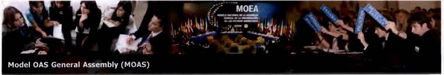
Model OAS General Assembly (MOAS)

Home » About the OAS » Office of the Assistant Secretary General » MOAS » High Schools