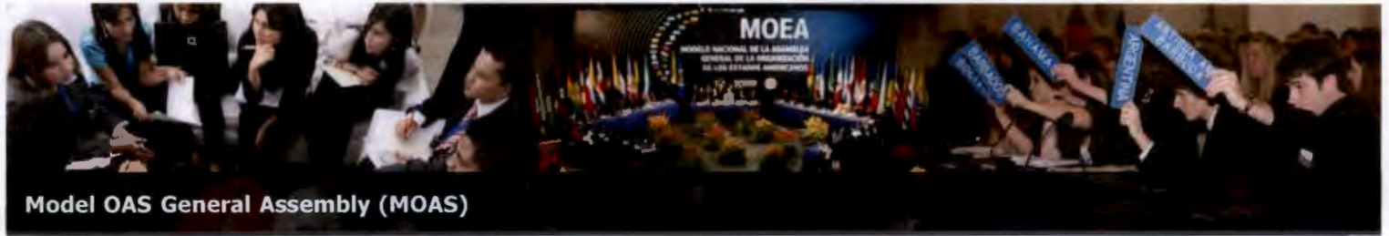
Model OAS General Assembly (MOAS)

Home » About the OAS » Office of the Assistant Secretary General » MOAS » MOAS Description