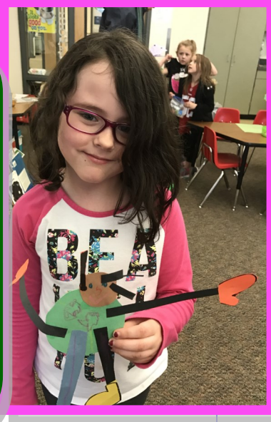
Matching kinder buddies.