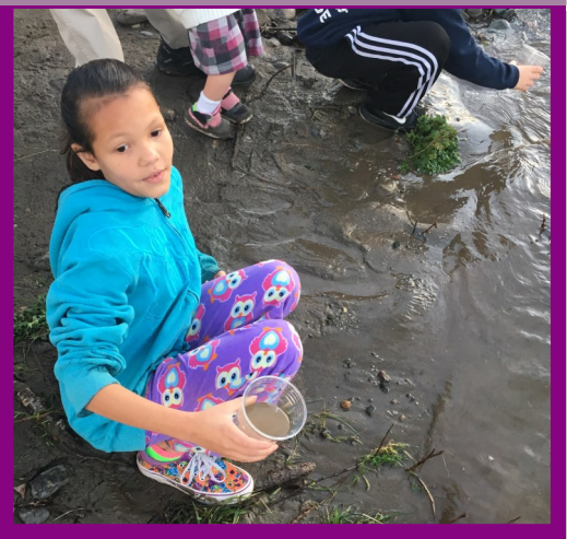
Kinders hard at work.